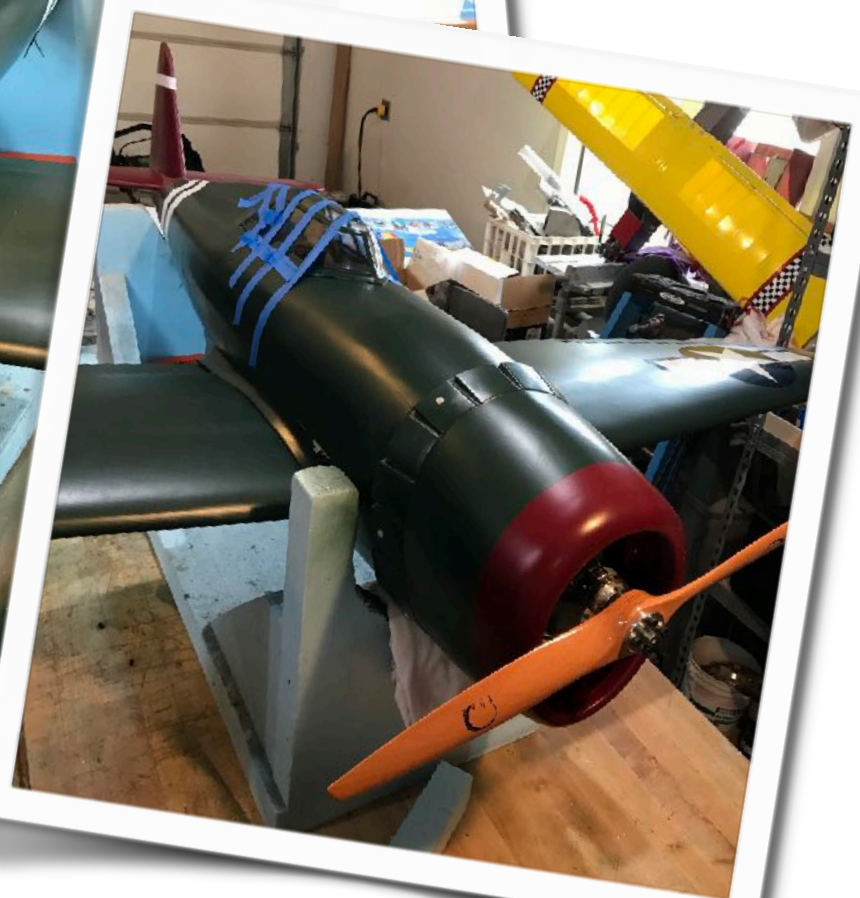
Ray Peterson with giant scale Top Flite P-47