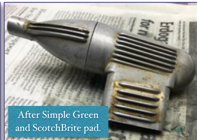
After Simple Green and ScotchBrite pad.