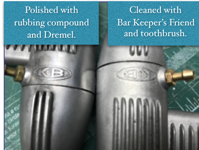
Polished with rubbing compound and Dremel.