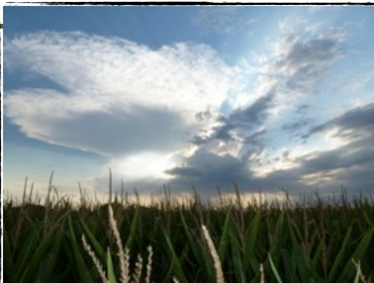
T h o u g h t s o f S u m m e r

https://sites.google.com/site/centraliowaeromodlers/home