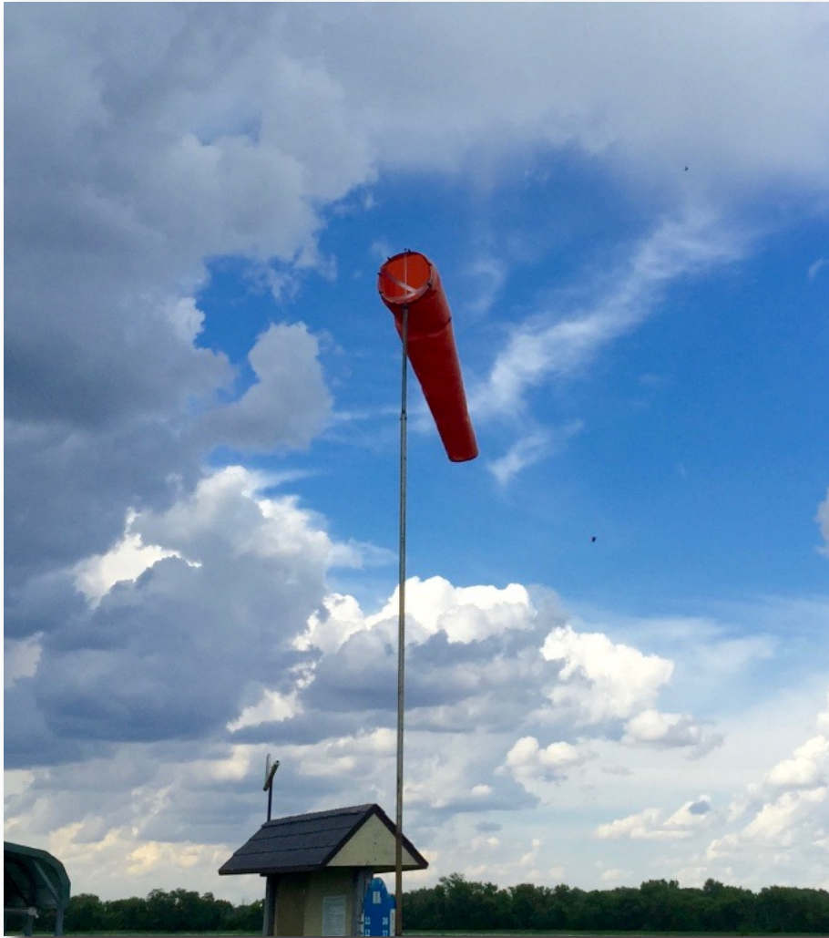
A patch of blue.

There is not much to report this month. The Allis has a new belt on the belly mower. Frank is looking after the hydraulic motor for the Jacobsen mower deck. It has been leaking hydraulic fluid, and lately to the point of soaking the blade belt, making it too slick to pull the blades through a heavy load.