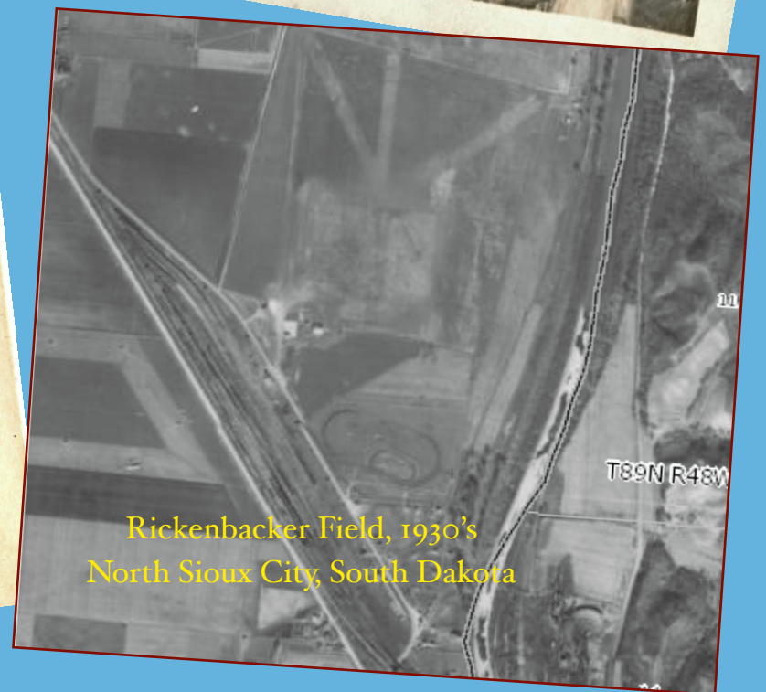
Rickenbacker Field, 1930's North Sioux City, South Dakota