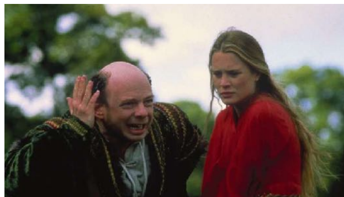
Wallace Shawn and Robin Wright in The Princess Bride

I am sure I can complete them with the information I have, but there have been posts from guys who feel like they are up a creek because they have the kit, but without plans or book. So, if you have them, or know someone who does, please get them digitized and made available.